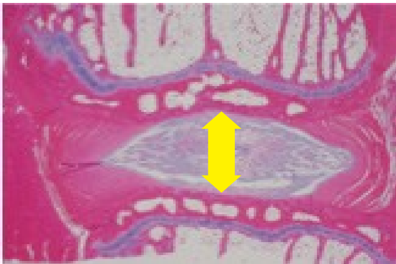
Intervertebral disk after treatment